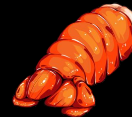
LOBSTER TAIL (5 oz)