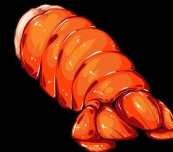
LOBSTER TAIL (9 oz)