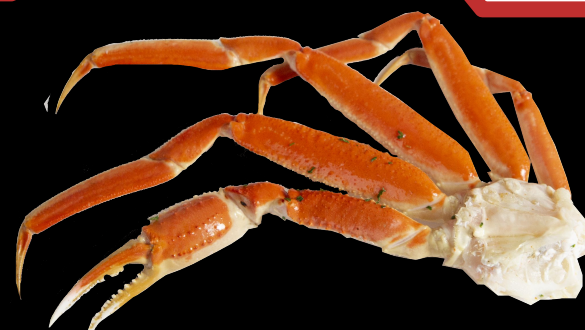
SNOW CRAB LEGS