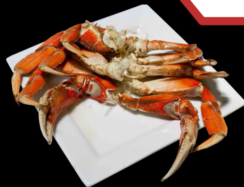
DUNGENESS CRAB LEGS