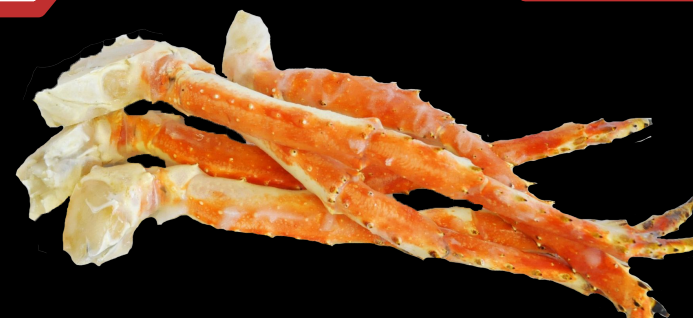
KING CRAB LEGS